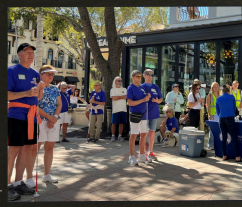
White Cane Walk Attendees enjoying the ceremony

Established in 1964 by President Lyndon B. Johnson, White Cane Safety (Awareness) Day commemorates state and federal laws requiring motorists to yield the right of way to pedestrians using a white cane or guide dog. Events held across the country celebrate the achievements, freedom, and independence of blind and visually impaired people.